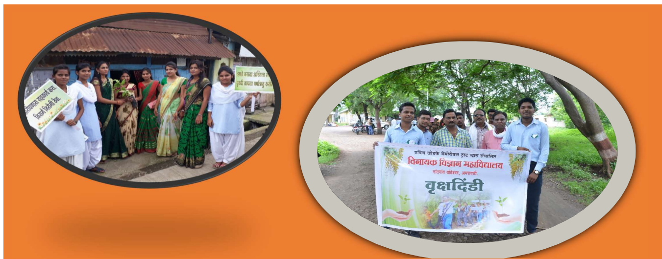
Students participated in the “Planting Rally”