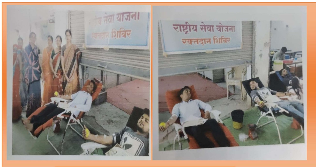
Students participated in “Blood Donation Camp”