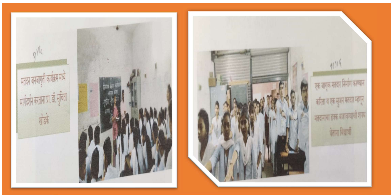
Students participated in the Voter’s Awareness and Registration Process