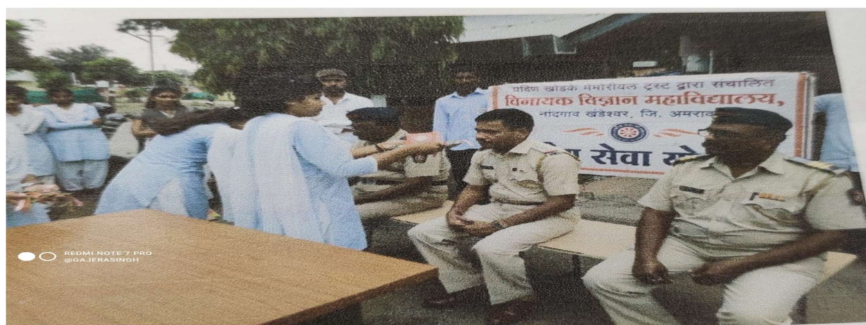
Celebrated Raksha Bandhan at Police Station, Nandgaon Khandeshwar