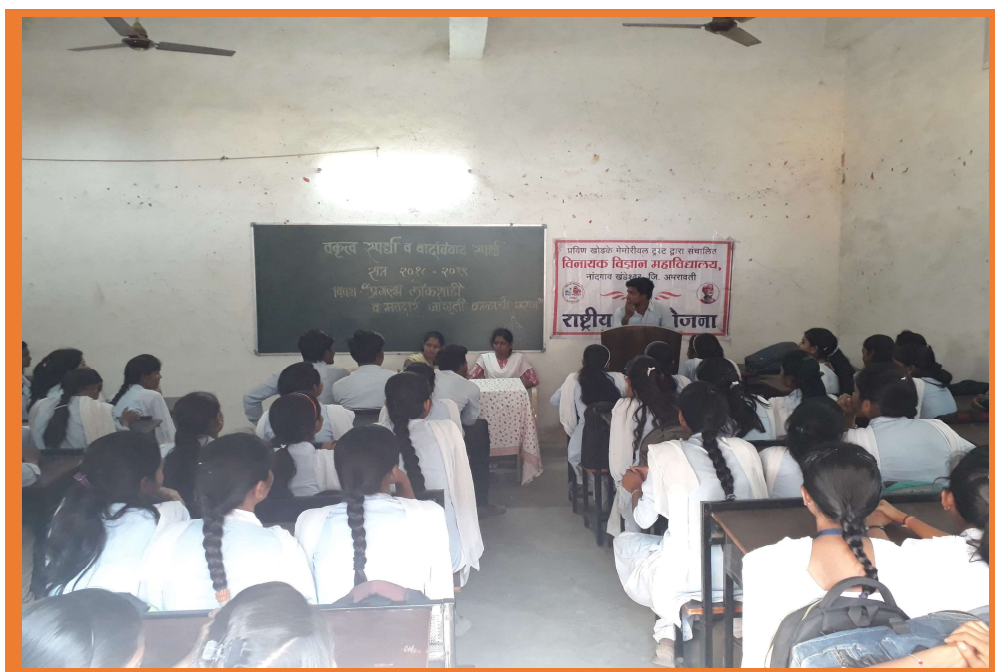
Students participated in “Debate Competition”